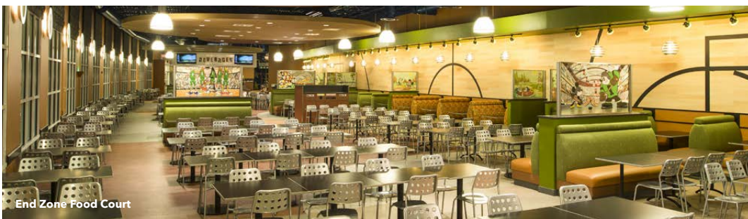
End Zone Food Court