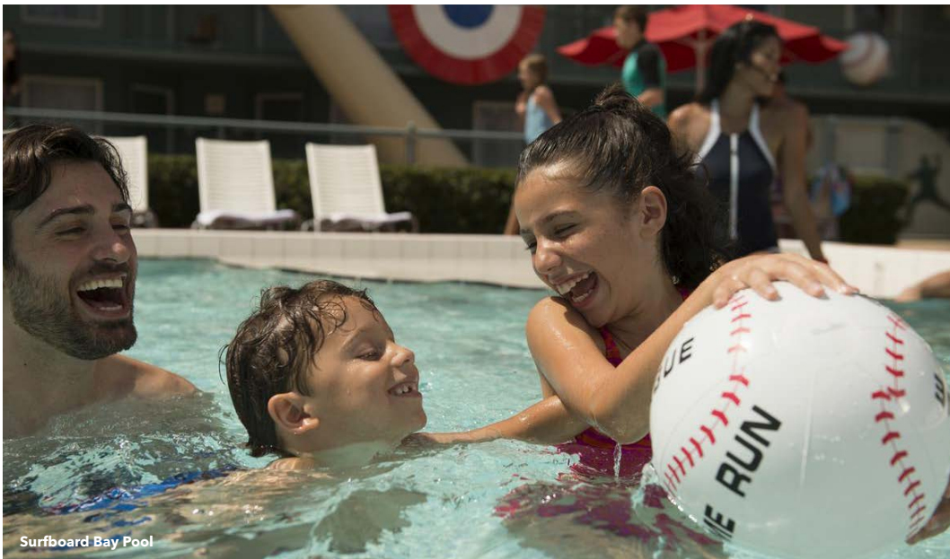
Surfboard Bay Pool