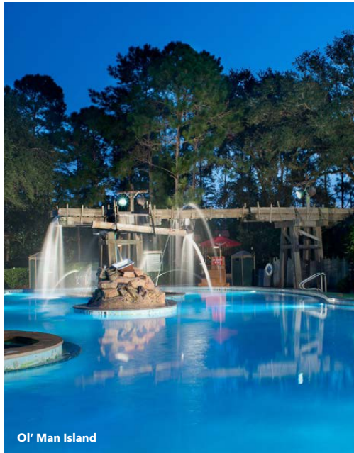
Ol' Man Island